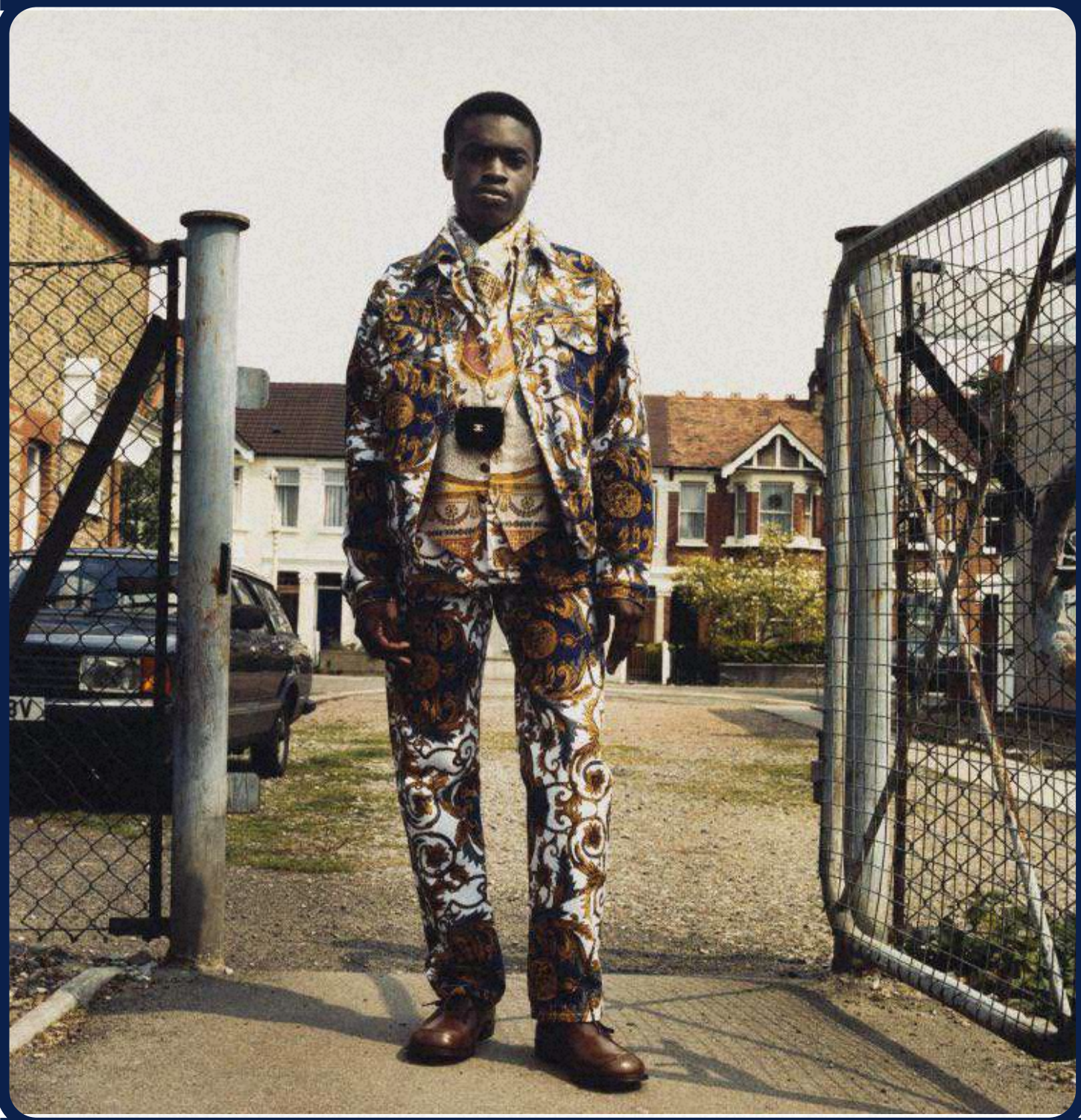
[no title] 1991