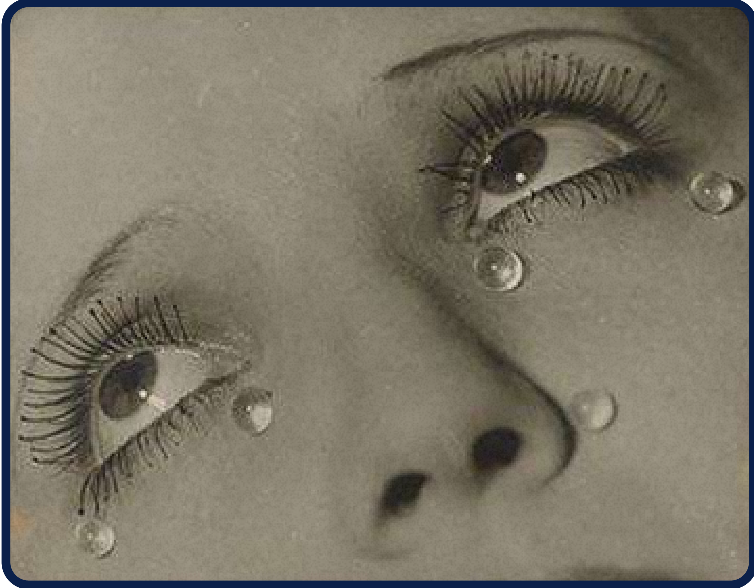
Glass Tears (1932)