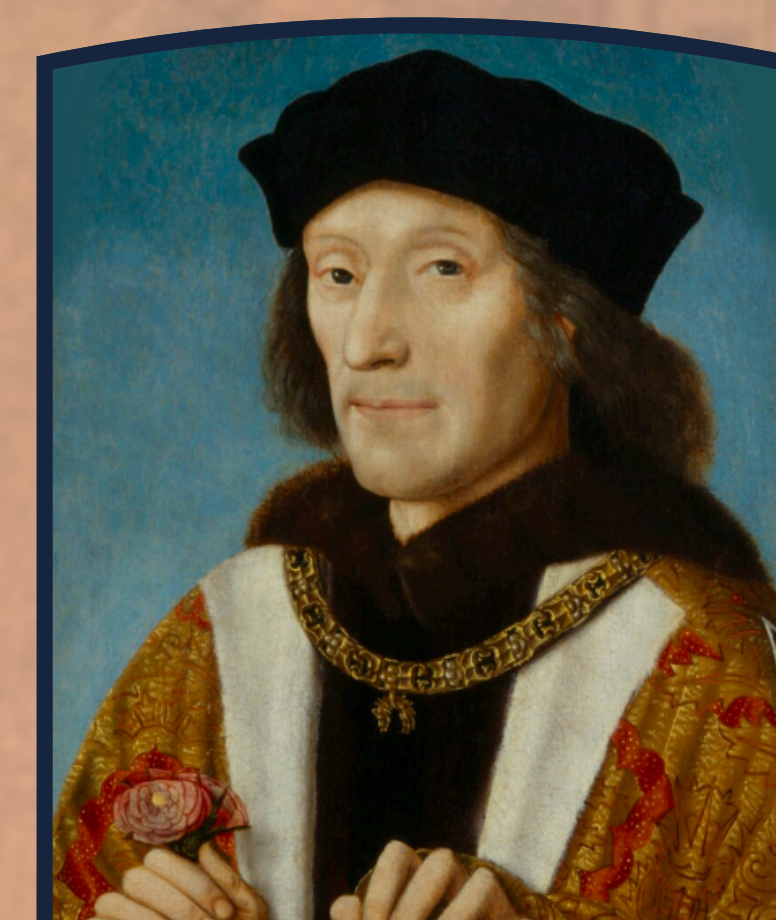
Henry VII (1485-1509)