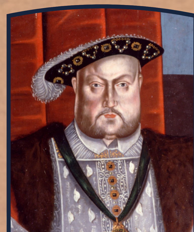
Henry VIII (1509-1547)