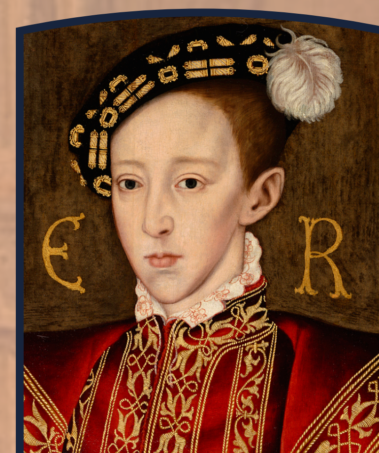
Edward VI (1547-1553)