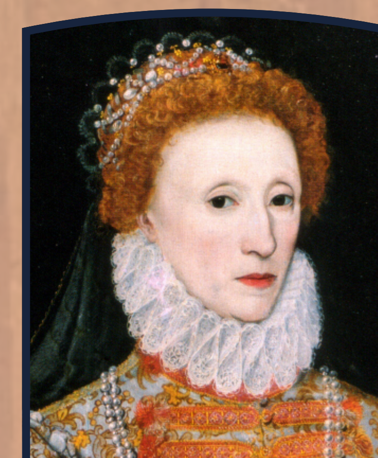
Elizabeth I (1558-1603)