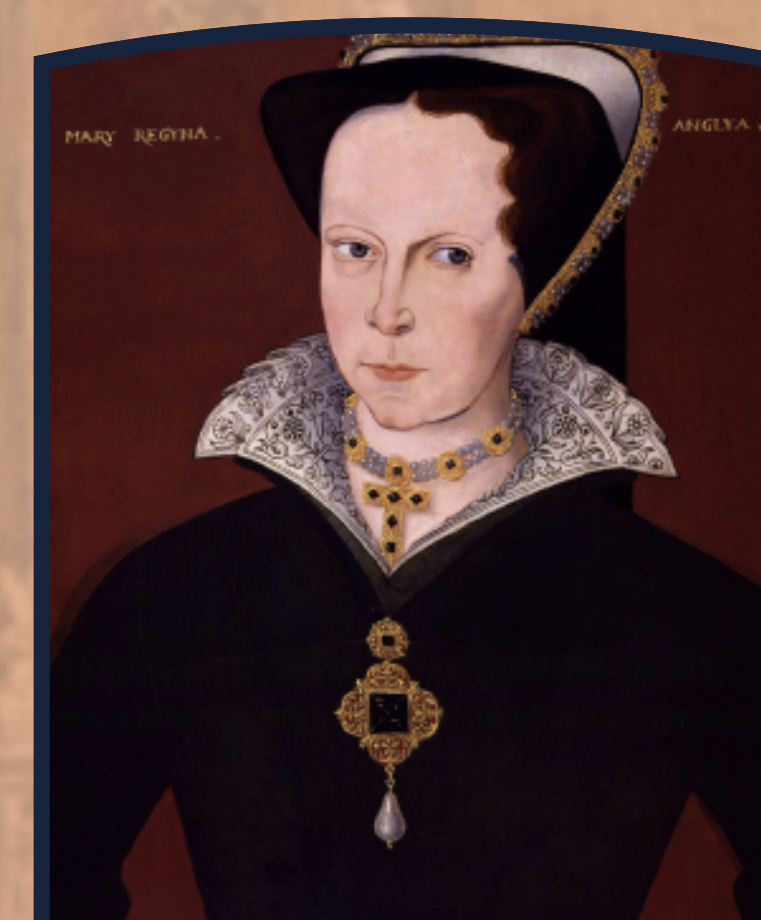
Mary I (1553-1558)