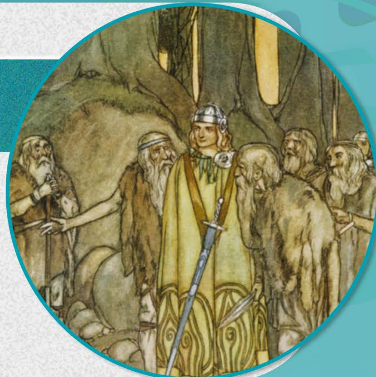
Marble Arch Caves

Legend says that Finn MacCool made Lough Neagh as well as the Giant's Causeway.