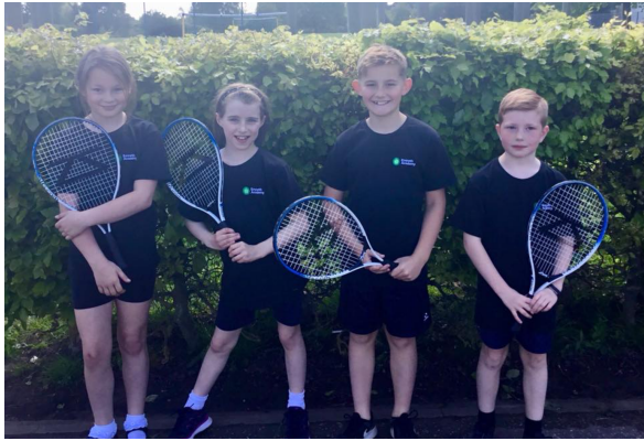
Y3/Y4 SSP West Norfolk Tennis Competition, qualified through the cluster competition.