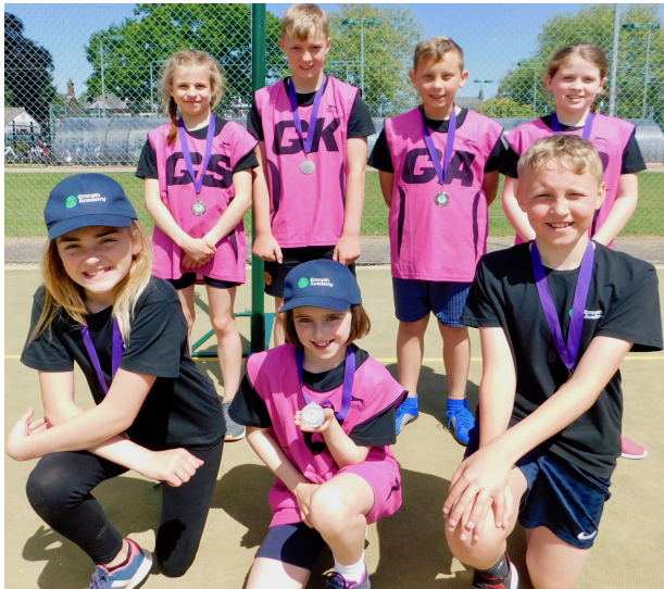
Our Netball team won the Cluster competition and came 2 nd in the SSP West Norfolk competition. They finished 5 th in the Norfolk School Games Netball County Championships.