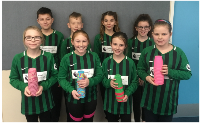
Attending the OMNES Games Speed stacking competition.