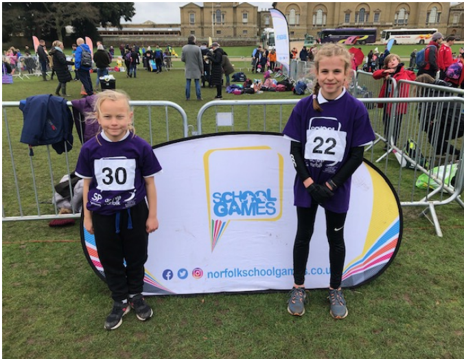
Two children qualified for the County final, held at Houghton Hall, finishing in 11 th and 5 th .