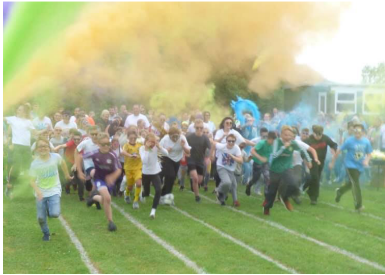
We hosted our very first colour run this academic year. Whole school participation.