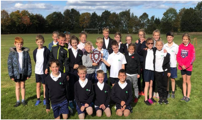
Cluster Cross Country Champions. 14 children then progressed to the West Norfolk SSP Finals.